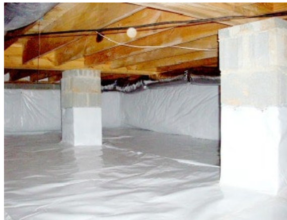
Closed (sealed) Crawlspace

That's the question that is constantly being debated, especially with builders and many home inspectors.